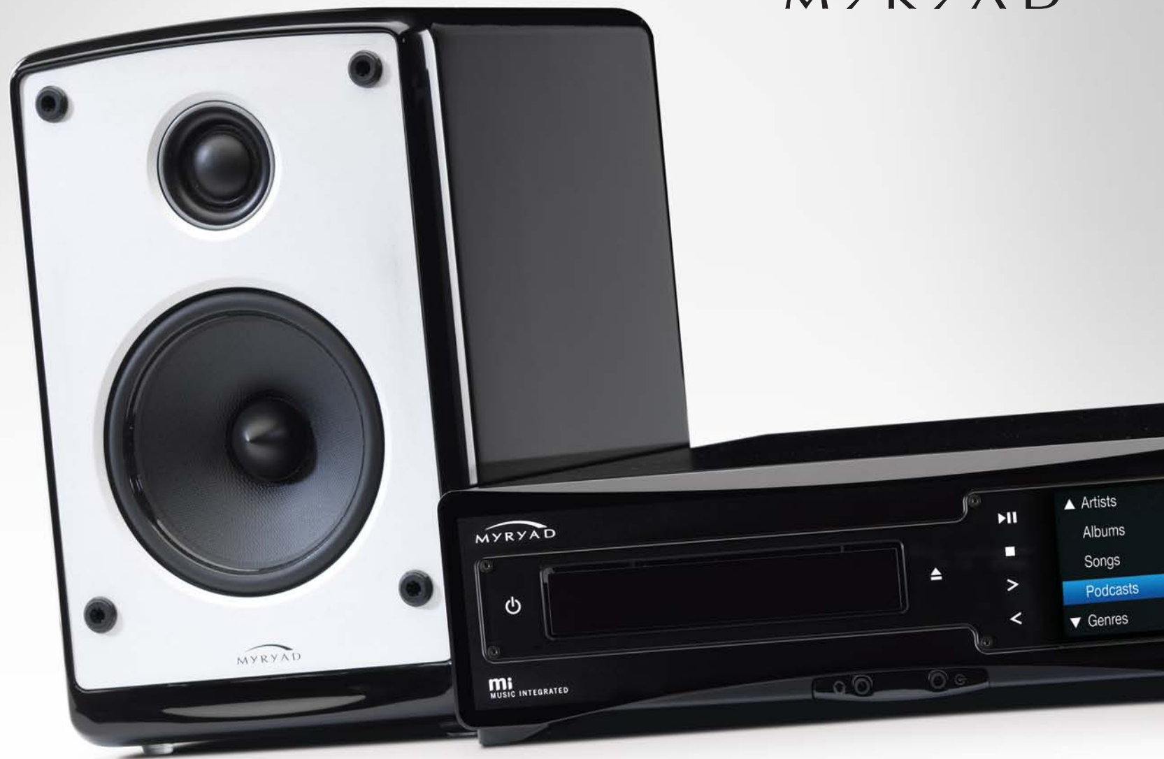
Mi, MX, Z Series Electronics A Series Loudspeakers