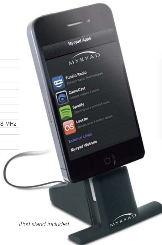
iPod stand included

Dimensions (w x h x d): 350 x 57 x 314mm