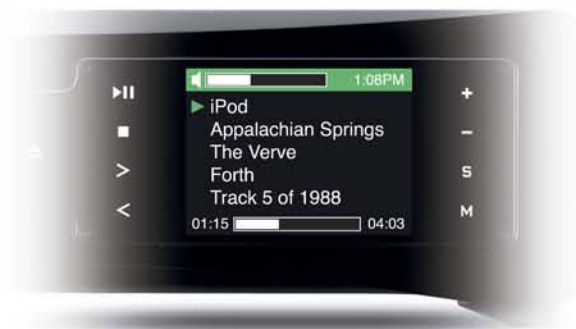
Screen display examples